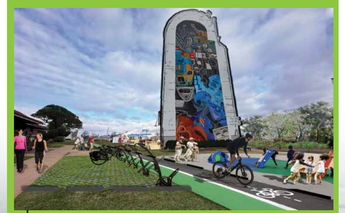
REVITALIZATION OF THE HISTORIC TRAIN DEPOT