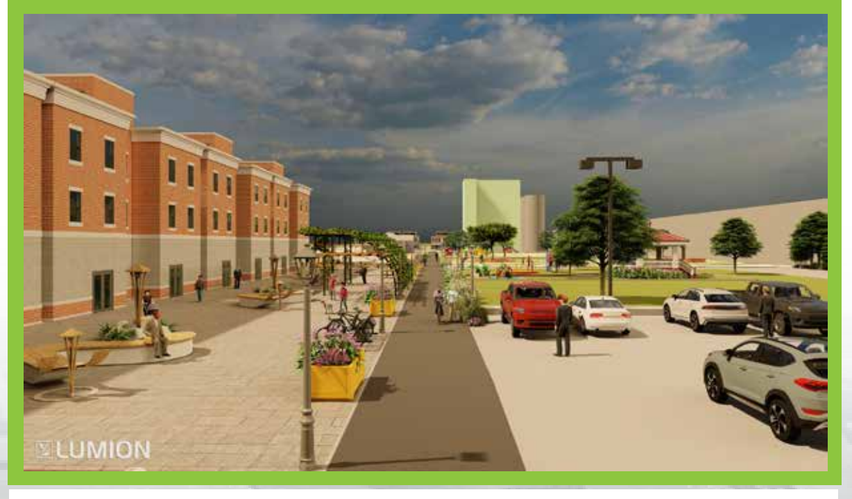
INTEGRATED RECREATIONAL SPACES WITHIN THE MIXED-USE HOUSING DEVELOPMENT